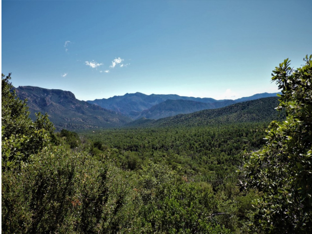
Chiricahua Mountains