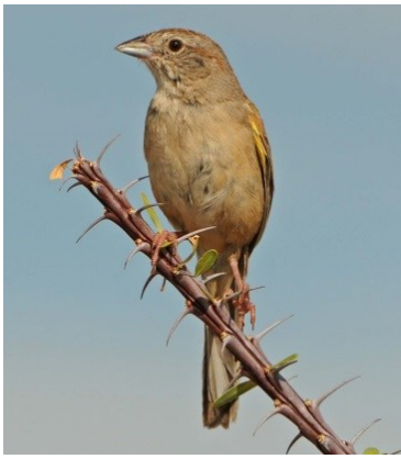
Botteri's Sparrow