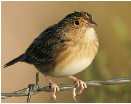
Grasshopper Sparrow