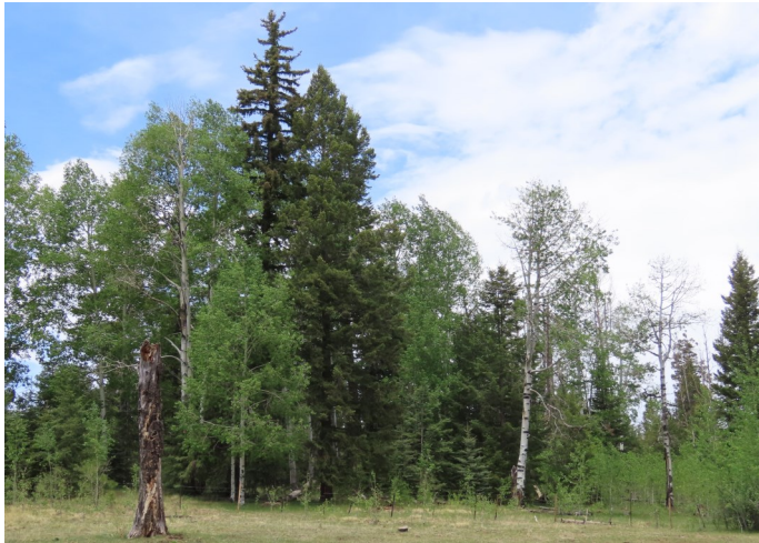
Mixed Conifer-Aspen Forest