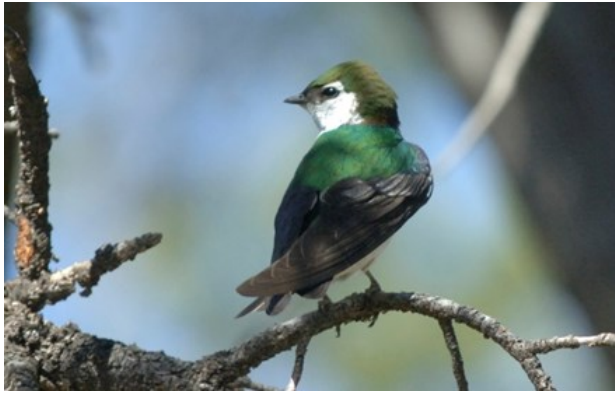
Violet-green Swallow, photo by ©George Andrejko